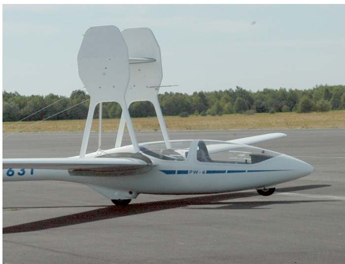
Fig. 1. "Flying lab" PW-6 glider

The flow structure around the aircraft wing is well known and thermography is routinely used in such cases to visualise the region of laminar-turbulent transition [1], [2]. Typical flow structure that also needs to be identified is a laminar separation bubble. The Institute of Aeronautics and Applied Mechanics leads a "flying lab" program (see figure 1) aiming to investigate fluid dynamic phenomena in real conditions. Traditional measurement techniques cannot be used in this case. Thermography is seen as a new tool allowing to identify flow features. The following pictures show correlation between the pressure distribution and thermograms obtained using camera - figure 2a as well as liquid crystals - figure 2b. Both thermographic methods are able to show in detail the position as well as the extent of the separation bubble.